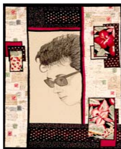
Memories 2005 ®

Using a simple pen and a light table, learn to add images, shadows, and shading to fabric with lots of tiny dots. No drawing skills necessary. This workshop is perfect for all levels.