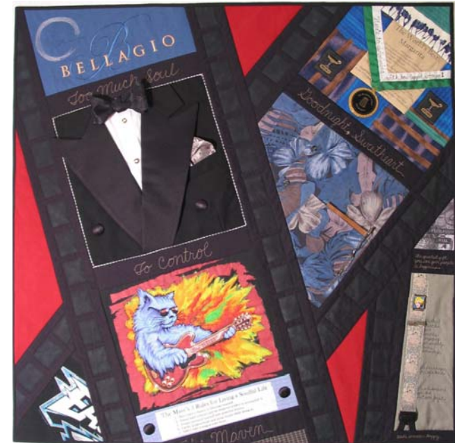
Too Much Soul to Control 2006®

Cyndi Souder Moonlighting Quilts Lectures, Workshops Custom Quilts