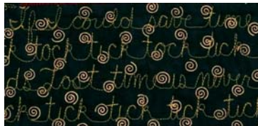
From Time Flies ®

Learn different ways to add freemotion machine-quilted writing to your quilts. We'll talk about how to keep the lines straight, how to choose your quotes and then scale them to fit the space. For intermediate machine quilters or confident beginners.